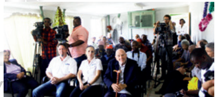
Caring for our elders...senior citizens at the Katutura Old Age home during a visit of the Parliamentary standing on Human Resources, Social and Community Development

The home was visited by the Parliamentary delegation from the Standing Committee on Human resources, Social and Community Development on 08 April 2014. The aim was for the committee to experience first-hand information on the living conditions of the elderly. The Parliamentarians and senior citizen at the old age home had an information sharing meeting before touring the home.